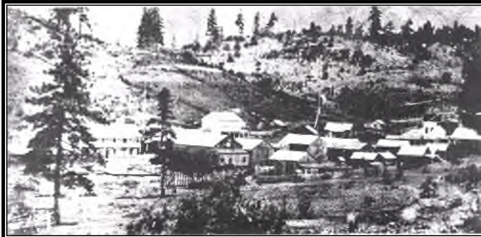
To Left: The town of Waldo as it appeared in the 1930's shortly before it was abandoned.